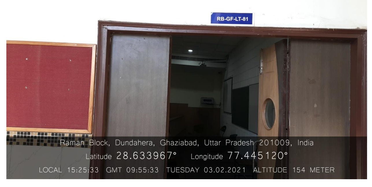
LT-81 (Raman Block, Ground Floor)