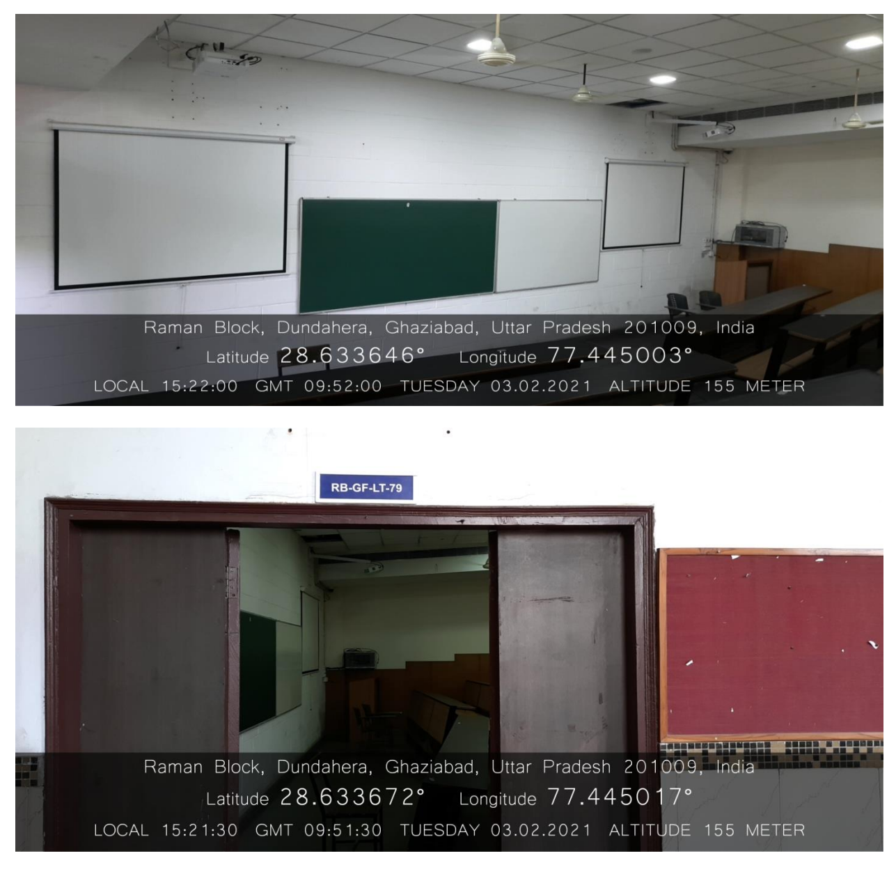
LT-79 (Raman Block, Ground Floor)