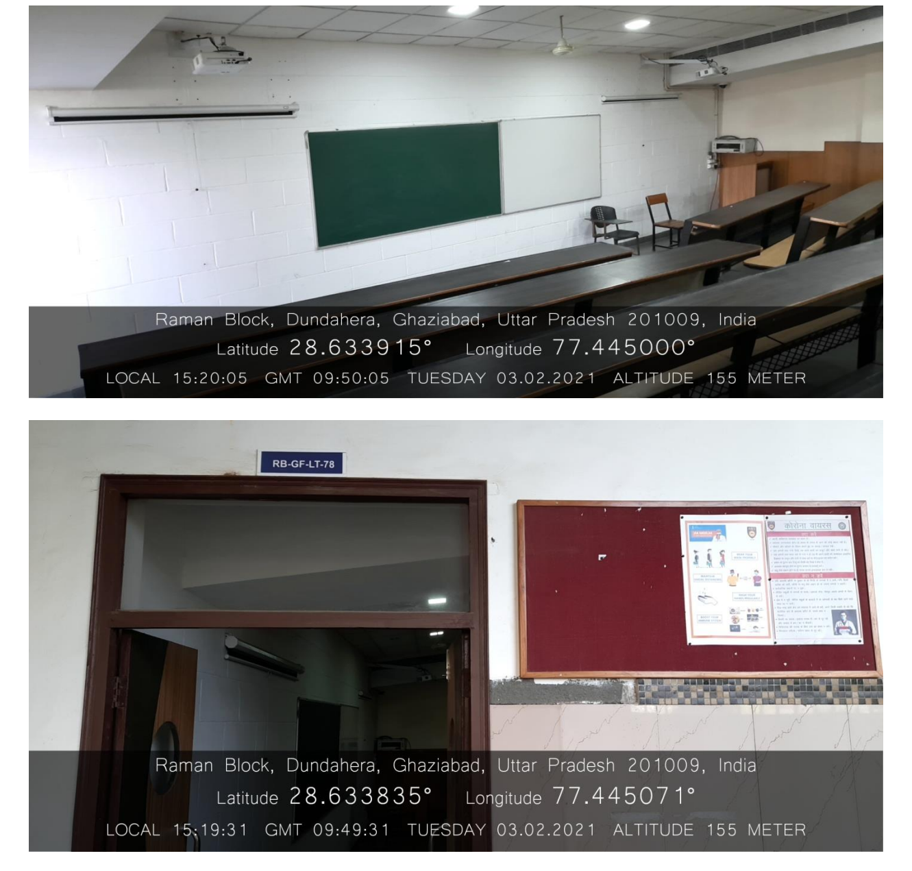
LT-78 (Raman Block, Ground Floor)